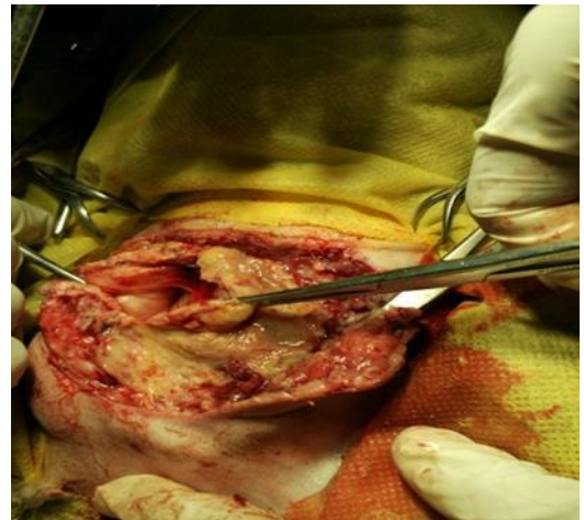
Figure 2. the removal process of mammary gland tumor in feline

After surgery, elizabeth collar was covered to avoid scratching and biting. Medication namely meloxicam, clindamycine, vitamine C and calnex were prescribed. Three days post surgery the wound has not dried completely and still swollen. Five days later, the wound was dried and recovered beautifully. The scar was almost dim entirely (Figure 3).