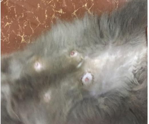
Figure 3. the recovery process after surgery

In recent years, the case of mammal or other tissue sarcomas and/or carcinomas in cats and dogs is increased significantly. probably associated with exogenous and endogenous factors such as age. environmental pollutions, viruses, helminths and other carcinogenic substances (Misdorp Munson and Moresco 2002. 2007). However, in this case, the cause of the tumor was unknown, probably related to environmental pollutions.